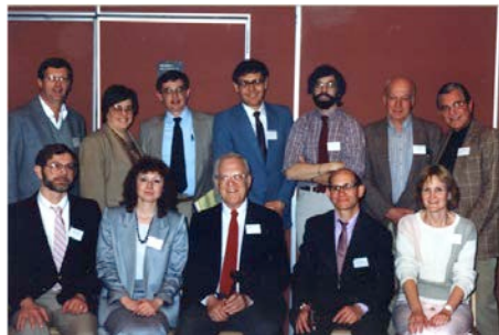
First board and the local organizer, April 9 th , 1987.